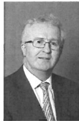
Attorney General Seamus Woulfe SC

"At no stage has the Government ever explained the public policy reason for reducing judicial involvement in the proposed board and replacing this expertise with people who have no knowledge of which candidates are suitable, or characteristics required, for judicial appointment.