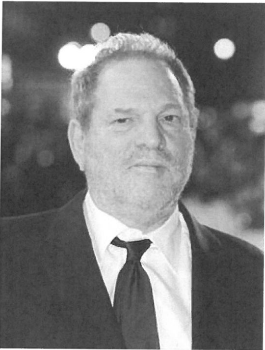
Harvey Weinstein 1